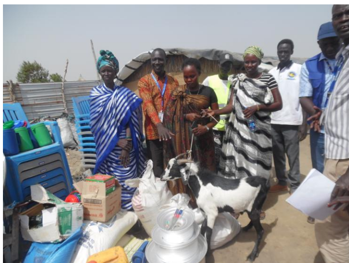
Distribution of Livelihood Kits in Bentiu and Rubkona

HACO has revised its Humanitarian response to encourage the community to undertake rapid food production among the most vulnerable communities, the organization also advocates for the protection of their livelihoods and help to reduce the community's dependency on humanitarian aid while building their resilience.