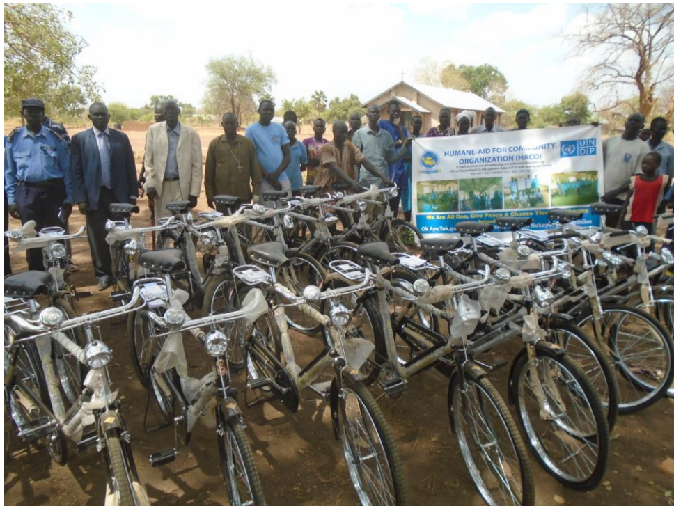
Distribution of Bicycles to the community peace committees in Yirol East-Panyijiar County Supported by UNDP

Work to increase community participation and involvement to eradicate SGBV, promote peaceful co-existence, promote education services and increase access to quality welfare of both children and adolescents and especially girls, particularly those affected by conflict of different kinds and emergencies.