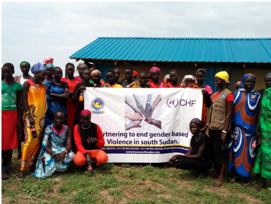
A women a girl friendly center in Ganyliel Payam of Panyijiar County, Unity State

HACO Provides GBV prevention through community outreaches, Comprehensive GBV services to GBV survivors like case management, Access to Justice and referrals and women's group support through Livelihoods