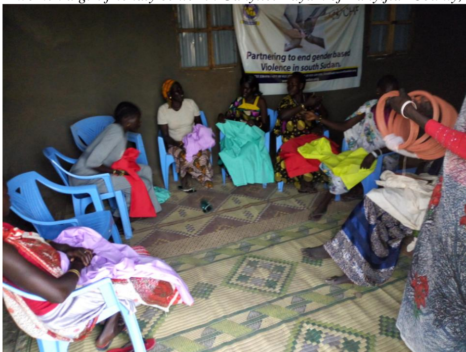
Women taking part in knitting, sewing and weaving in a women and girls friendly center in Ganyliel