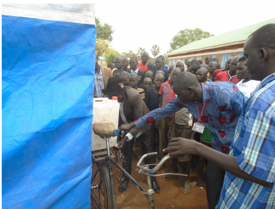
Hand washing training session in Yirol East

HACO Strives to offer health services to communities that are affected by Man Made or natural disasters as well as improve and sustain access to community managed Water resources, Sanitation and Hygiene services that will eventually contribute to reduction in morbidity and mortality due to WASH related diseases and ailments.