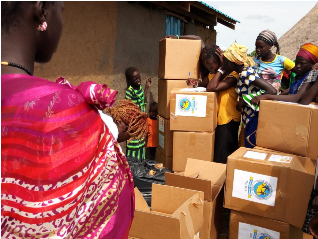
Distribution of Dignity Kits in Ganyiel Payam, Panyijiar, Unity State Supported by UNFPA