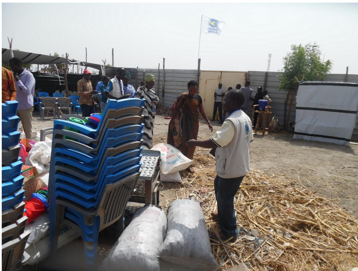
Distribution of livelihood kits to beneficiaries in Bentiu and Rubkona