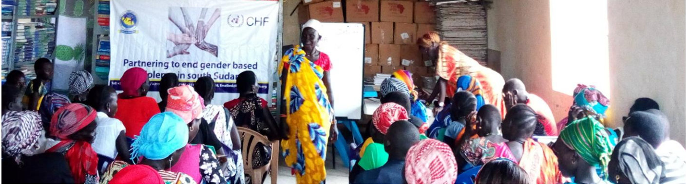
Training of Women and Girls at Ganyiel Payam, Panyijiar: Unity State; sponsored by SSHF