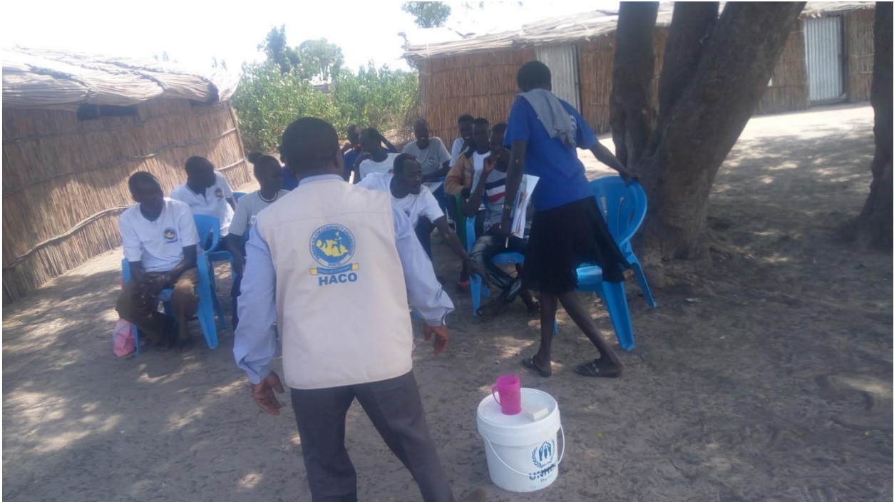
Wash Training Session in Rubkona County of Unity State